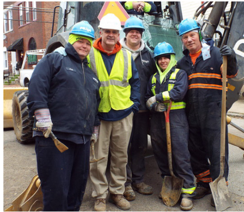
PWSA crews are dedicated to providing safe and reliable drinking water.

Our customers have made it clear that we must improve to become the water utility Pittsburgh expects and deserves. The 2018 rates will provide funding to deliver critically needed improvements to the systems that deliver safe and reliable drinking water, reduce basement flooding, and prevent sewage and stormwater from entering our rivers.