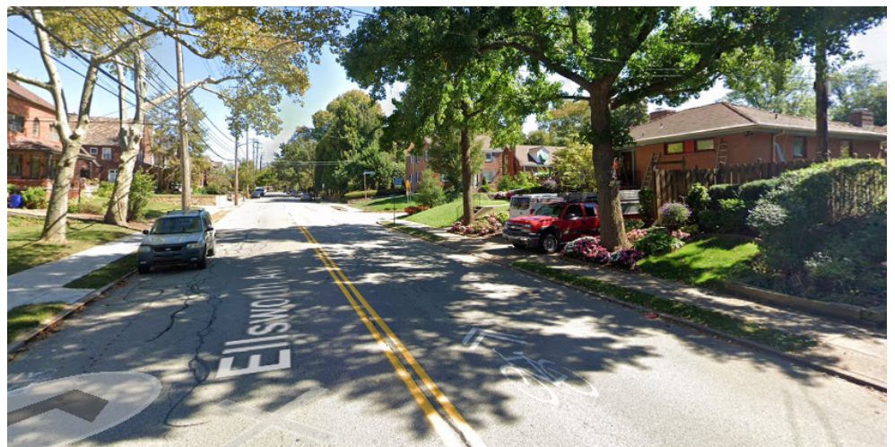
Existing sharrows on Ellsworth Ave, the second most biked route in the city

Proposed bicycle infrastructure will expand existing facilities in the East End neighborhoods, and improve connectivity between Oakland, Shadyside, and East Liberty as well as to the Walnut Street and Ellsworth Ave business districts, schools, universities, parks, and religious institutions. Expanding the Shadyside bike network, one of the city's most biked networks, will improve road safety for all users.