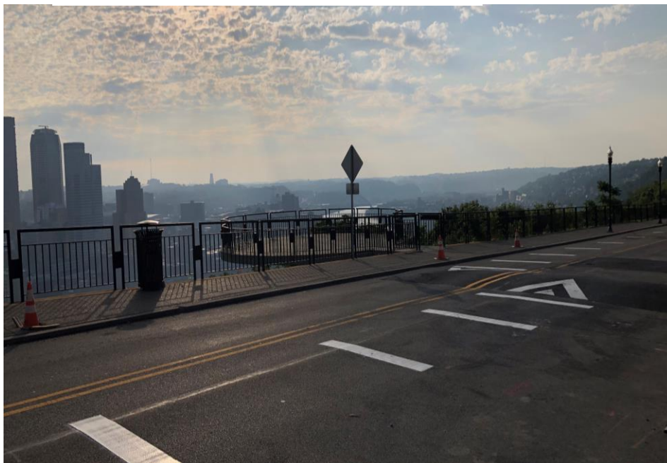
Speed Hump on Grandview Avenue