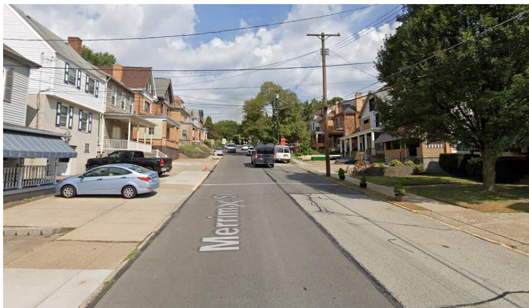
Merrimac Street between Woodruff and Grandview

Mount Washington, District 2 – Merrimac Street is a two-way street that serves as a collector for Mount Washington residents, providing access to Grandview Avenue and Sawmill Run Boulevard (SR 51) via Woodruff Street. Merrimac Street is owned by the City of Pittsburgh and the posted speed limit is 25 mph.