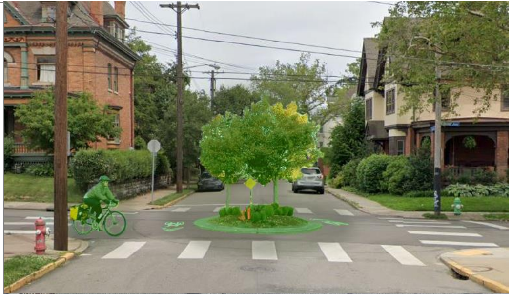
Coral Street at Roup Avenue 2019 (traffic circle rendered)

Bloomfield & Friendship, East End, Districts 7 & 9 – Neighborways are low-traffic streets that prioritize pedestrians, bicycles, and other non-vehicular traffic and offer a safer, more comfortable alternative to busy arterial streets. Neighborways typically run through residential neighborhoods and use context-appropriate traffic calming tools to keep speeds slow and safe for all users. They aim to connect neighborhoods and feature clear signs and pavement markings to help people easily navigate through Pittsburgh.